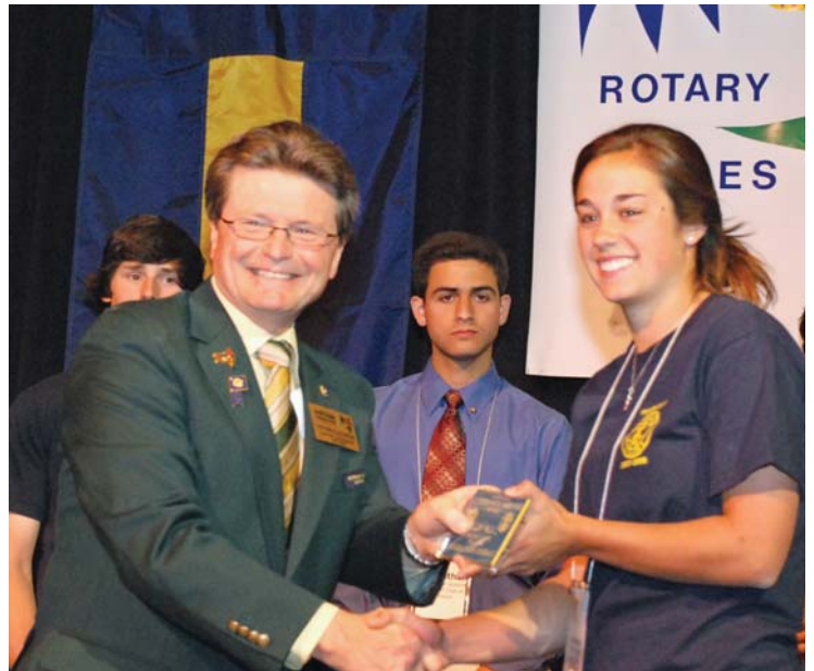
Interactors receiving their award at District Conference