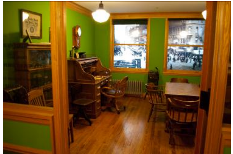
Replica of the 711 office where the original Chicago club met

One Rotary Center does not have the significance of a religious 'Mecca', but that doesn't diminish it's importance to all of us.