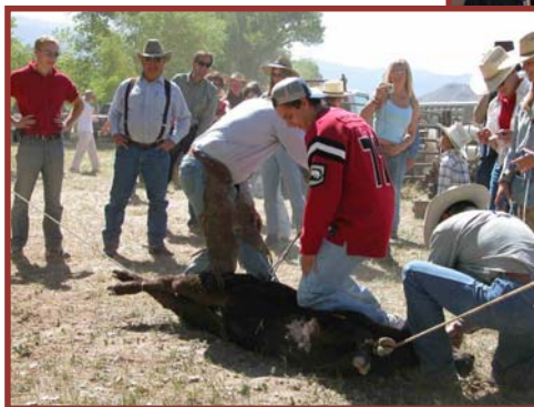
RYE students in Yerington

gave funny stories of dumb questions asked. At the end, they all lined up in their many-colored Rotary blazers and said thank-you in their own languages. There wasn't a dry eye in the place!