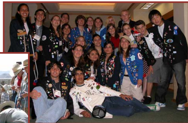
RYE students at the District Conference

The following weekend the Yerington Rotarians hosted the Inbound students for the annual Yerington Calf Branding weekend. The students watched, and some participated in the branding of the calves. Following the branding the students joined the buckaroos for a lunch of Rocky Mountain Oysters, tri-tip, and beans. Other activities for the weekend included camping out at the Snyder Ranch, trap shooting and archery.