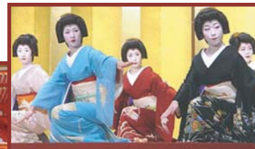
Traditional Japanese architecture and entertainment was a highlight of this year's Convention.