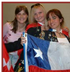
RYE Students at the Conference